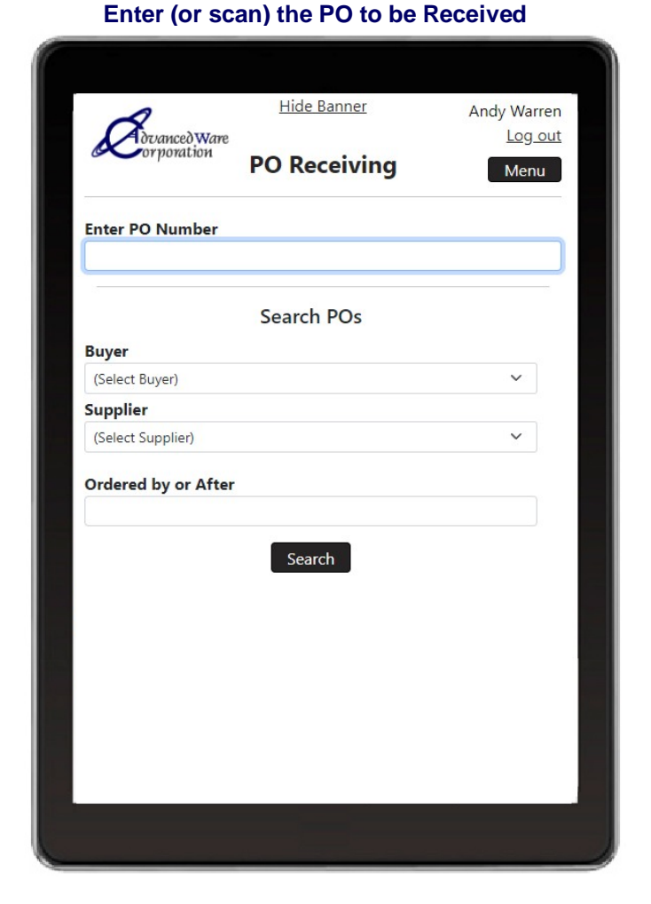
PO 1234567 being Received